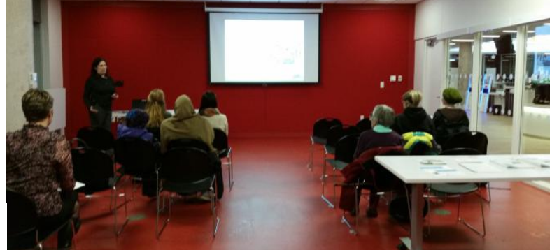
Halifax Central Library session