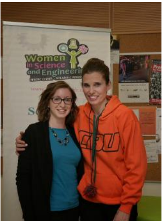
WISEatlantic Program Coordinator with Minister Duncan