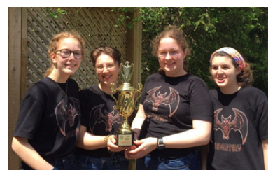
The Robats 2022