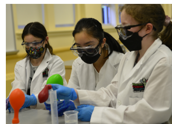
Junior Summer Camp 2022