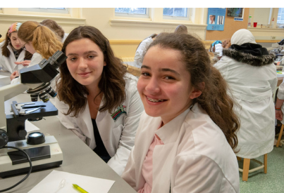
2018 Retreat participants in the lab